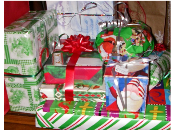
Service Coordination staff purchased gifts for deserving families with donations the community.

According to staff members, the families were thrilled with all of the presents they received! One family, with six children and two adults, were "so thrilled to know that people do care and would like to thank everyone from the bottom of their hearts." Rather than go without, this year, each child received a small toy, and food was purchasing to make the families' Christmas dinners special. Each child also received socks, and either shoes or sneakers, as many had outgrown the ones they were wearing.