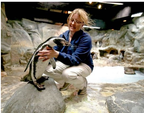
A staff member plays with Opus, one of the Humboldt penguins at the Aquarium of Niagara

We're excited to announced the Merry and Bright event, now February Fundraiser, is rescheduled for February 25th at the Aquarium of Niagara, from 5:30-8:30 PM.